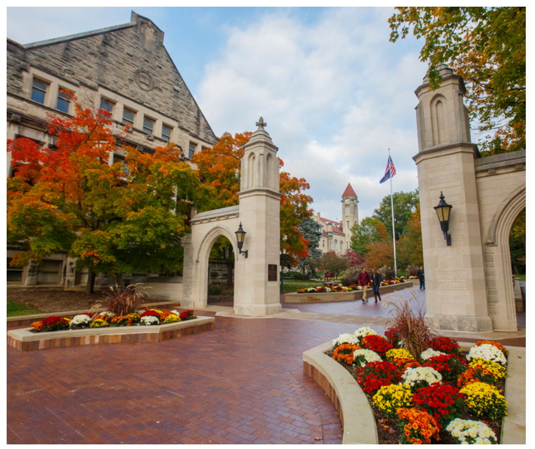
IU Bloomington Sample Gates

There are more than 770,000 living IU alumni in all 50 states and in 155 countries, and are organized in over 100 chapters and groups.